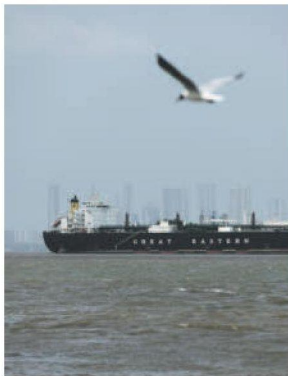
India is the world's second-largest importer of LPG.

istry of petroleum, Indian Oil Corp. Ltd, BPCL, and Hindustan Petroleum Corp. Ltd remained unanswered.